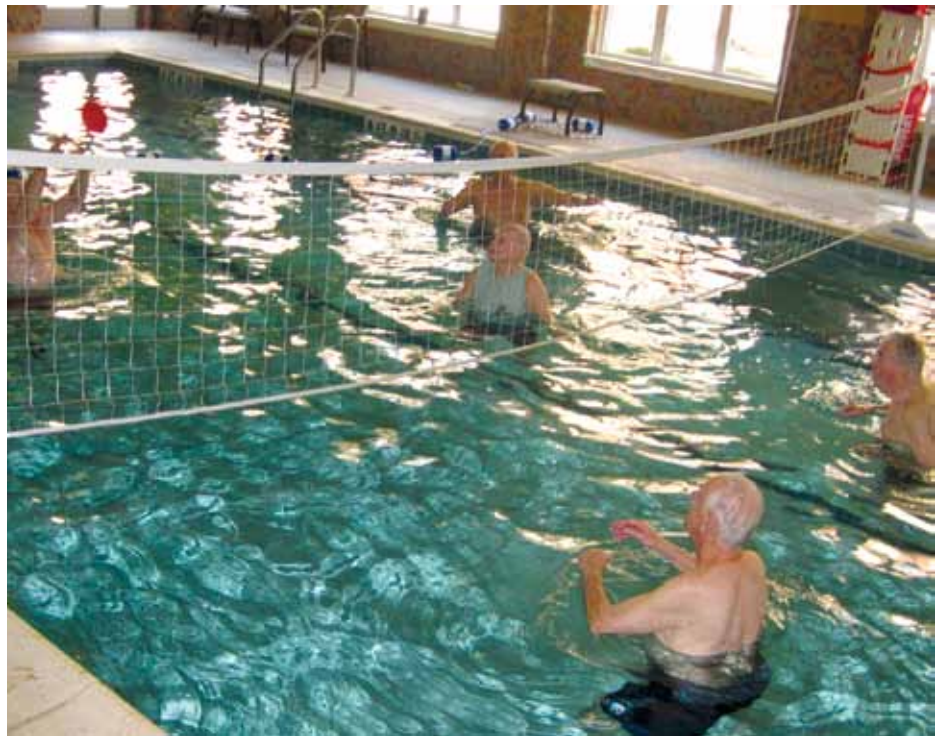
Some community members start off the day with a lively game of water volleyball in Providence Point's indoor swimming pool.

In Providence Point's Wellness Center, the pool isn't the only thing that is heated. The competition during the men's pool volleyball game can also get quite fierce as well. The residents started the volleyball games just a few months ago and continue to build participation. The pool isn't the only area where team competition has taken root either. Providence Point residents have started lessons and competitions in billiards, Wii bowling, and there's now talk of golf tournaments using the indoor golf simulator.