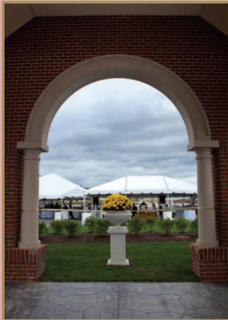
The Providence Point Opening September 2009