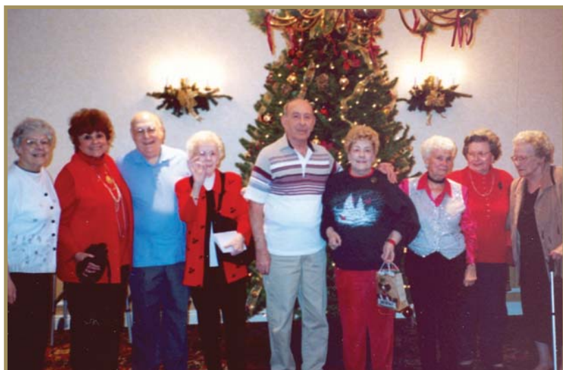
Manor residents enjoying the annual Christmas party.

When you see the word connection, what comes to mind? Making your connection at the airport? Wishing you had a high speed internet connection to surf the web faster? Or maybe it is something far more important, like the connections we have with one another? Since Baptist Manor opened in 1979, our residents have