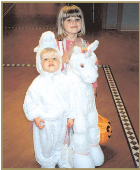
We loved the Halloween visit from these adorable unicorns!