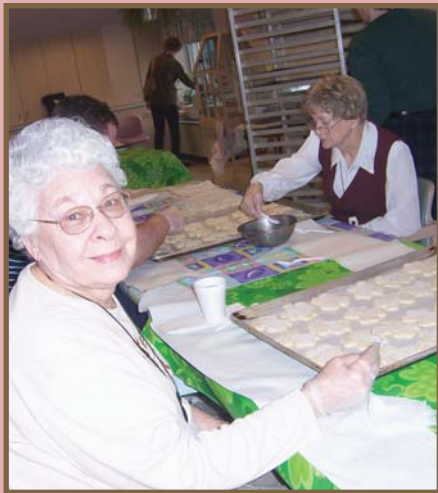
For our annual St. Patrick's Day Express, residents decorate cookies to be delivered to Howe Elementary School students.