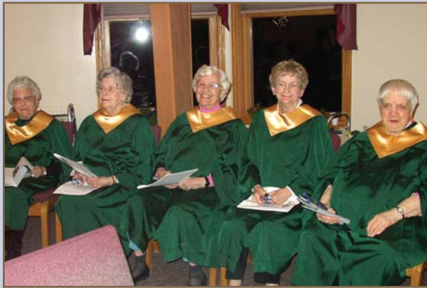
Several members of our Chime Choir smile for the camera before their debut at our Christmas event.