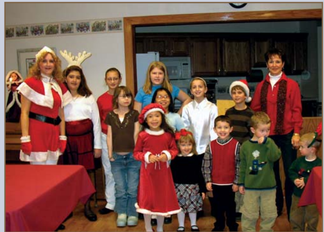
It was all smiles as our youngest performers completed their final rehearsal for the Christmas music program.