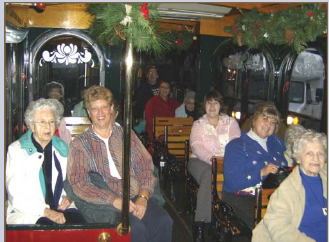
Molly's Trolley provided a festive ride for our residents' trip to see the Celebration of Lights at Hartwood Acres.