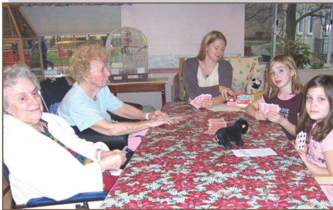
Cards, anyone? Our Hand-in-Hand intergenerational program spent one of its monthly meetings playing card and board games.