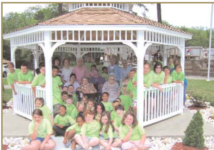
Residents joined children from the Walnut Grove Summer Camp program for a picnic at West Mifflin Park in June.